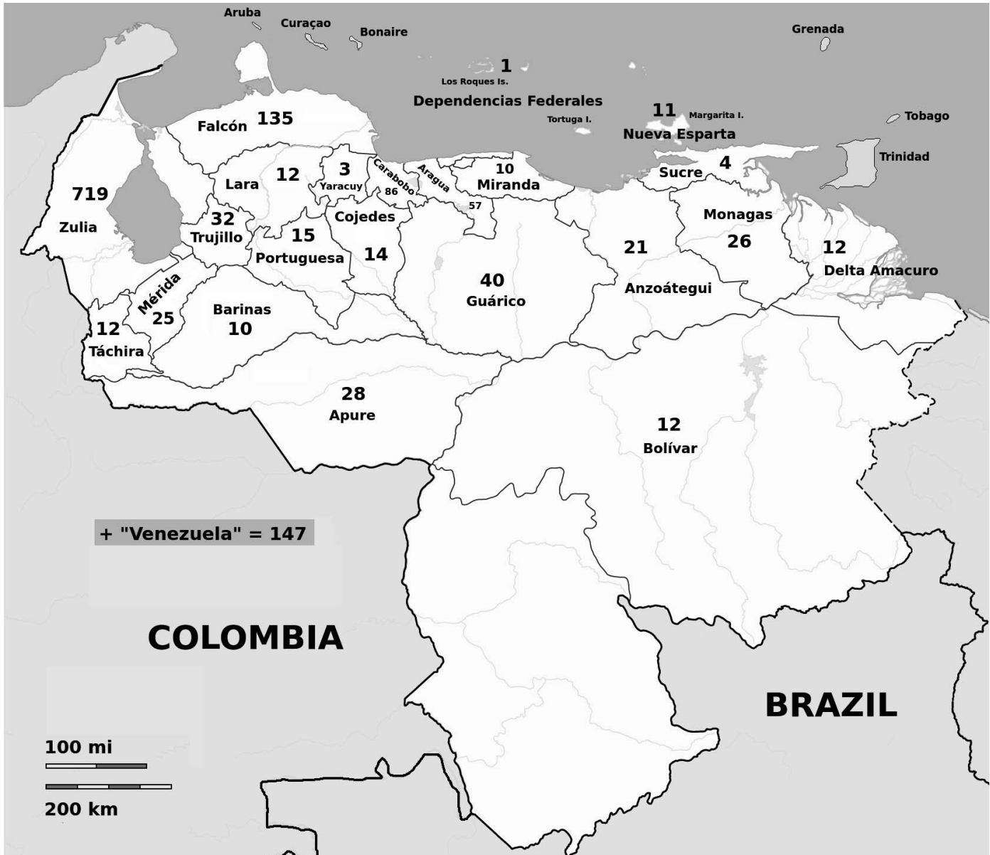
Fig. 3—Recovery locations of 1,432 blue-winged teal in Venezuela, 1926–2017. All birds were banded in North America.

and Buckley, 2002). The farthest recorded migrant was a royal tern banded in June 1976 in the U.S. state of Maryland and harvested 3,328 km away in the Venezuelan state of Sucre in February 1977. Nearly all (99%) royal terns were banded on the East Coast of the United States; 65 (55.6%) were banded in the U.S. state of North Carolina, 37 (31.6%) in Virginia, 10 (8.6%) in South Carolina, and 4 (3.4%) in Maryland. Only one individual (<1%) was not banded on the East Coast, and this individual was banded on the U.S. Gulf Coast in Mississippi. These states of original banding correspond roughly with band recoveries from The Bahamas (Buden, 1991) and Colombia (Casas, 2012).